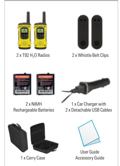
2 x T92 H 2 O Radios