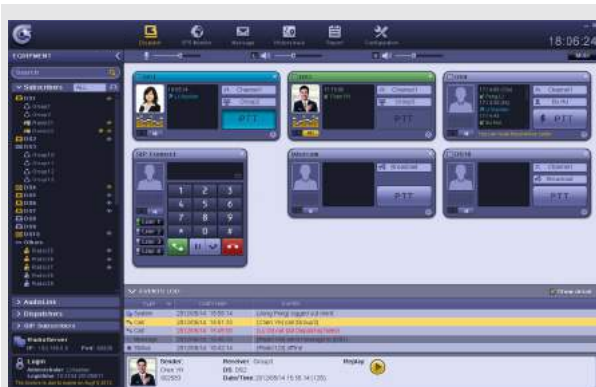
Voice Dispatching Screenshot

This feature allows Hytera dispatch system to track the location of any radio units in real-time. Users have an option to display the location route on the mapping. The tracking interval depends on the location update interval configured in each radio and the channel loading of DMR system. Total number of location tracking activities can be activated at one time will depend on the mapping system and limitation of system resources.