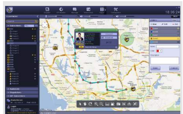
GPS Positioning Screenshot