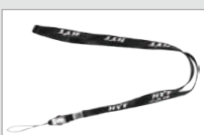
Hand strap (Nylon) RO01