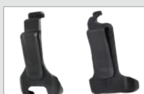
Belt clip BC20, BC21, BC23