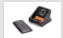
Wireless charging kit POA113