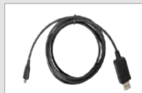
Programming cable USB PC69