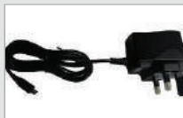
Universal Switching Power Adapter (Micro USB)