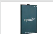
Lithium-ion battery (2000 mAh) BL2009