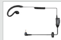
Earphone with C-clip EH516