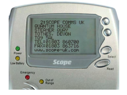
8 line mode (3 mm text height)

The GEO84Z WM is the pager with a difference. Designed to be desk or wall mounted, it provides superior alerting capabilities with its large 4 line/8 line screen, bright LED's and loud audible alert. Power is supplied by PSU/charger and internal rechargeable back-up battery.