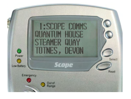
4 line mode (6 mm text height)