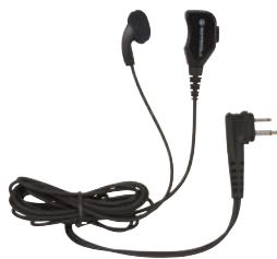
Earbud with In-line Microphone and PTT