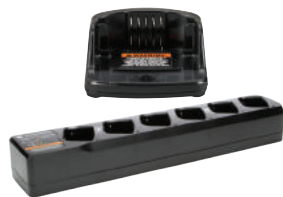
Single and Multi- Unit Chargers