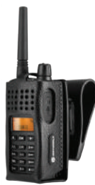
Leather Carry Case