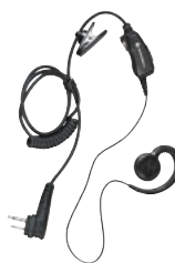
Swivel Earpiece with In-line Microphone and PTT