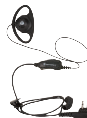
D-Style Earpiece with In-line Microphone and PTT

XT600d Series radios are compatible with XT400 Series accessories except the carry holster and leather case.